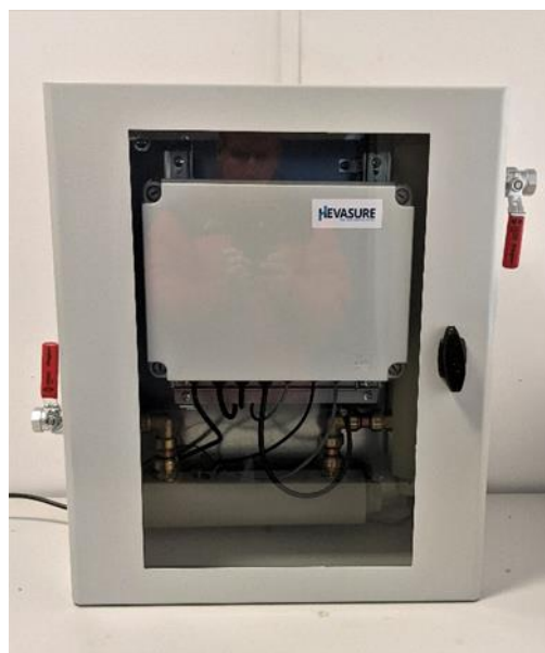
Figure 1: Hevasure Aquila Monitoring Station

Reference should be made to the document 'Installation of Hevasure Monitoring Station – Enclosure Model'.