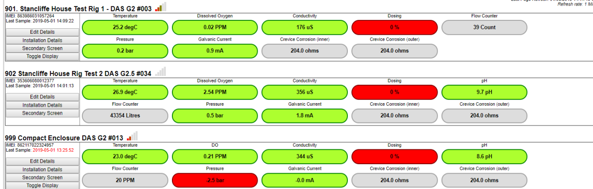
Figure 2: Hevasure Data Dashboard

Last Page Refresh: 01/05/2019 14:11:45 G3 Refresh rate: 1 Min